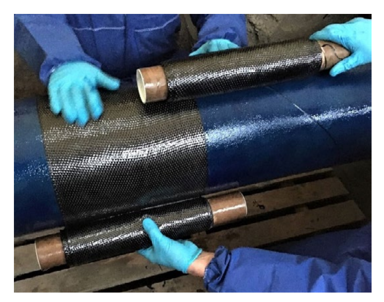
Figure 4. Easy application of DEXPAND-CF70.

The independent laboratories of TÜV-Süd (certificate IS-AN11-Muc/ml-1915) have verified the fatigue strength of