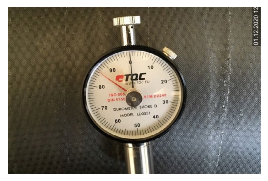
Figure 3. Exceeded minimum hardness requirements.