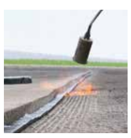
Activate TOK®-Band A with a flame in seconds