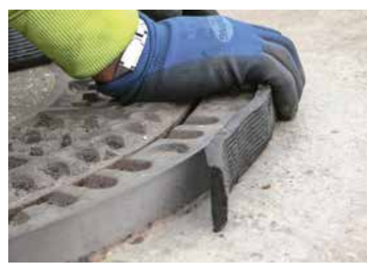
Ideal for a multitude of different materials and applications, such as manhole components and concrete edges.

The high-performance, self-adhesive TOK®-Band SK can even be used without primer. This means that laborious and time-consuming priming and air-drying of the edge of a joint is no longer necessary! No primer also means no hazardous substances that have special transport and storage requirements.