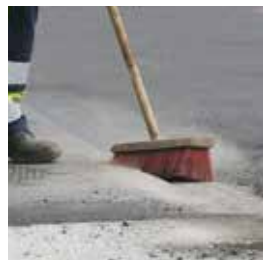
Clean and dry the edge

And TOK®-Band A doesn't need a time-consuming primer either. As Marc Neumann, Construction Manager at A-Tec Asphaltbau GmbH, explains: "We only need to apply a light flame to the TOK®-Band A and it's done – without primer. We can get it done in double-quick time – 100 m takes us 2 to 3 minutes."