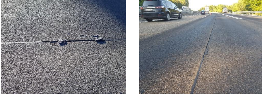
Fig. 4 and 5: Raised hot-pouring compounds

If a hot-pouring compound is used in this joint, the new asphalt is first added and then, once the asphalt has already cooled, a joint is subsequently cut between the old and new asphalt layer. This joint is then filled with hot-pouring material. But, hot-poured joint compounds can stick to car tyres and – in a worst-case scenario – may be pulled out of the joint by the vehicle. If this happens, the additional repairs are time-consuming and costly, and will create huge traffic delays.