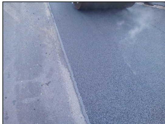
Fig. 3: TOKOMAT® joint along rolled asphalt

The TOK®-Riegel joint compound used in the TOKOMAT® process is, just like the bitumen joint tapes regulated in the ZTV Fug-StB, a joint material tested and approved according to the TL Fug-StB. The quality and compliance of the bitumen joint tapes and TOK®-Riegel with the standards are monitored by an external, accredited test institute three times a year. By contrast, standard EN 14188-1 for N1- and N2-type hot pouring compounds often does not require external monitoring for this area of application, which can impact on the quality.