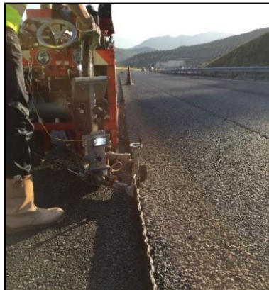
Fig. 2: Joint installation using the TOKOMAT® process