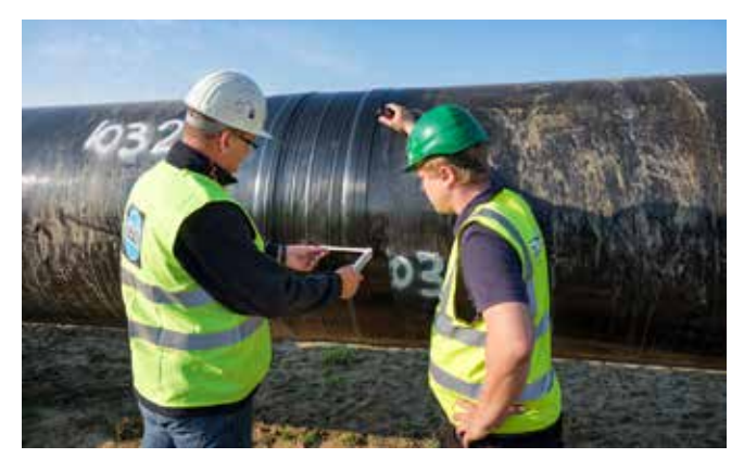
Figure 5. Quality inspection of the overlap width.