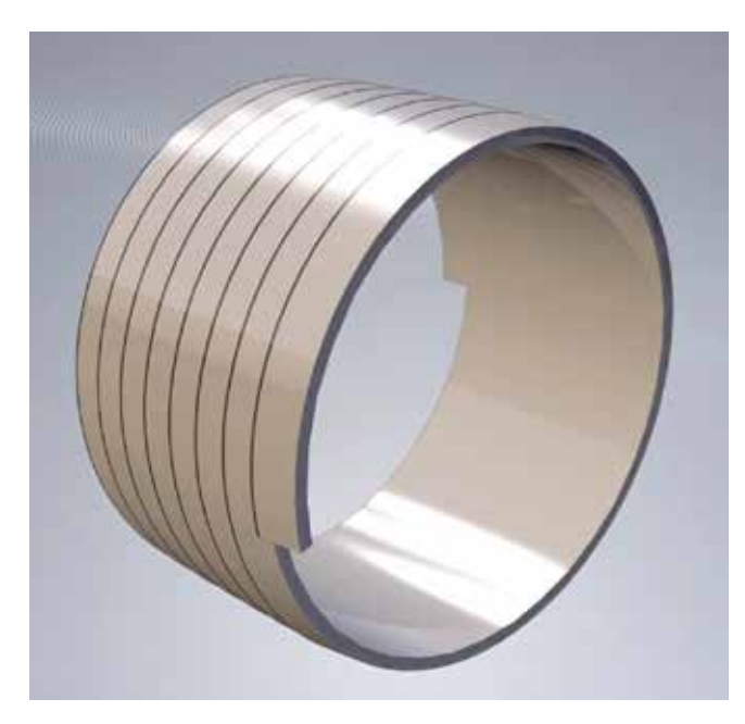
Figure 3. Permanent hose protection.