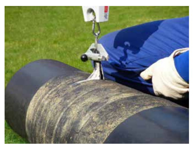
Figure 4. Cohesive separation pattern after 39 years.

efficient construction process for the coating of weld seams.